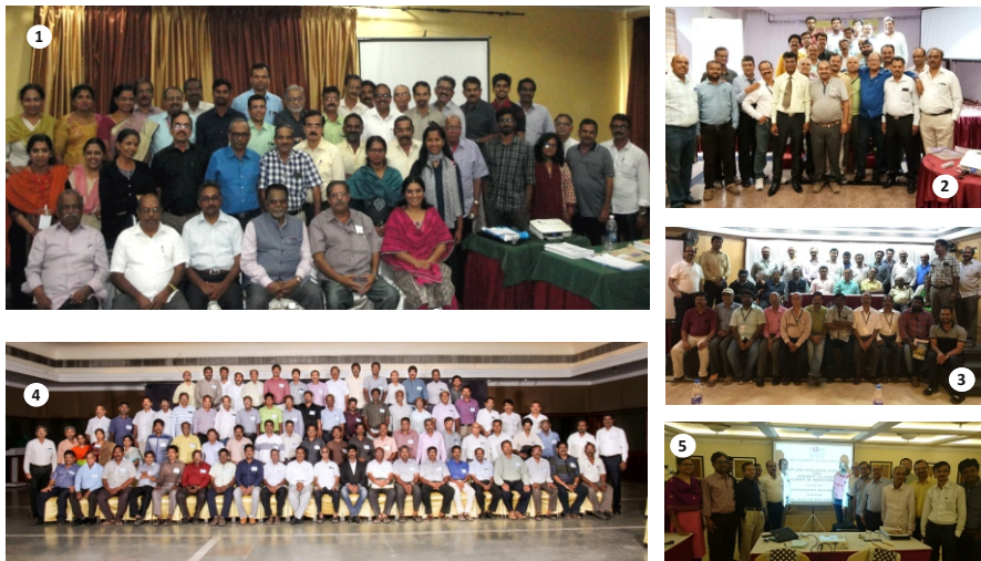
(Top) Our asset batch at Cochin, Jabalpur, Bangalore, Trichy and Vadodara